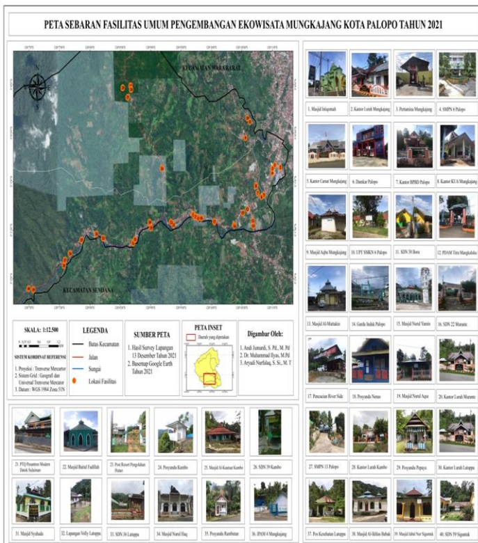
Figure 2. Development general facility distribution map Ecotourism Mungkajang area