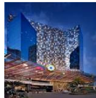
Figure 2. The Location of Muslim Fashion Festival Event, Kota Kasablanka Jakarta

The location of the MUFFEST 2021 activity is slightly different from last year which was held at the convention center. The event was held at the mall because during the discussion in November 2020, all venues were not authorized to operate or host the event. At first the committee also intended to hold it at the hotel, but the participants did not like it because the location was too private so it was difficult to promote their products. Thus, it was decided that the MUFFEST 2021 event would be held at the mall, i.e. at the Kota Kasablanka Mall. At that point, the malls were allowed to hold events, and it was safer to operate, and advertising would be easier because there were a lot of visitors in the mall. Because IFC has a partnership with the management of Pakuwon Mall, there is no need to pay rent for the venue, and since this venue is located in the city center, the accessibility is very good.