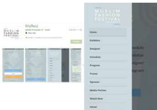
Figure 10. MUFFEST application

The applications utilized in this event were chosen based on their benefits. For example, Whatsapp or Skype are used to communicate. The other apps, such as email, also help distribute information, although email is usually used on a regular basis.