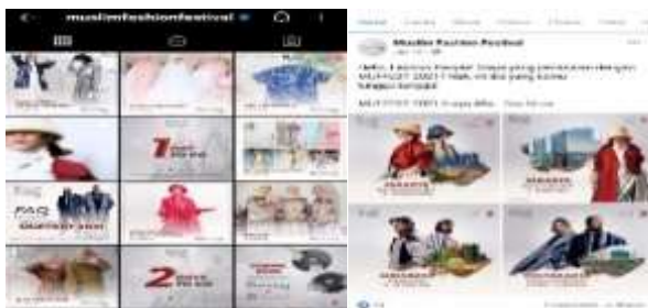
Figure 6. MUFFEST Media Sosial

Advertising, personal selling and sales promotion are all forms of marketing used in MUFFEST events. It's just that the nature of this year's promotion is more towards digital marketing. The marketing and public relations team consists of four (4) people, two (2) people for marketing and two (2) people for the public relations team. The following step is to implement and monitor the marketing plan that has been made during planning. Advertising activities during the MUFFEST event at Kota Kasablanka Mall were carried out using social media platforms such as Instagram, Facebook, Twitter, TikTok, and Youtube. Influencers on social media are an efficient way to advertise this event. Several celebrities or influencers involved in the campaign are individuals involved in Muslim fashion, such as Ima Mutiara, Hanny Harun, and others. Furthermore, this event is marketed through the website at www.muslimashionfestival.com .