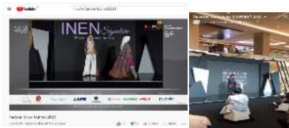
Figure 9. Live Streaming in YouTube and IGTV

present at the venue. This event has the potential to expand the reach of the event, making it accessible to those living in various locations around the world. This event is broadcast live streaming on many applications, including the "Muslim Fashion Festival" YouTube channel and Instagram live broadcast on the @muslimfashionfestival account. Interestingly, visitors can watch videos recorded on social media platforms if they are late. In addition, the organizers work closely with third parties, especially multimedia providers, for offline live streaming.