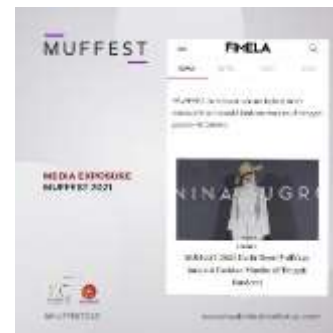
Figure 7. Media Exposure pada media Fimela

The personal selling activities of this event are via WhatsApp, Zoom, and Email. This event also created several online competitions, such as the Modest Young Designer Competition (MYDC) and the MUFFEST TikTok Competition, which is one way to use sales promotions. The role of public relations in publicizing events, such as communication with the media through structured activities, i.e. press conferences, and media exposure, is also significant. MUFFET Kota Kasablanka also collaborates with several media partners from print and electronic media, including Fimela, Chanel Muslim.com, Republika, Suara.com, Liputan 6, Radio 106.6 FM, 91.60 Indika FM, and others.