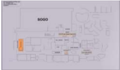
Figure 5. Venue acara

The committee must coordinate well with other parties so that the event can run smoothly.