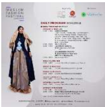
Figure 8. Program Acara

The operations team also held a final security briefing with contractors, multimedia vendors, and venue parties. Not only that, but they also marked each participant's booth zone. The operations team and all support teams are present on the day (show days) before the event starts. The role of the operations team is to ensure that all exhibitors' goods are ready for display, coordinate with the program team regarding the needs of event programs such as talk shows and fashion shows, coordinate with security and venues, and arrange for visitors to exit and enter the mall in accordance with standardized health protocols. The organizer added that every exhibitor or fashion show participant is required to do a COVID-19 swab test before attending the event to the health protocol section. During the unloading days after the event, the operations team ensures that loading and unloading procedures are running smoothly in collaboration with the security team.