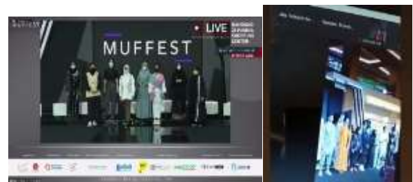
Figure 11. Zoom as a platform for a hybrid event

This event uses Zoom as a platform for meetings with exhibitors, journalists and guests. Organizers also take advantage of the Zoom platform to communicate with related parties during the pre-event. The opening ceremony, press conference, fashion show, and the virtual launch and virtual meeting of MUFFEST are some of them.