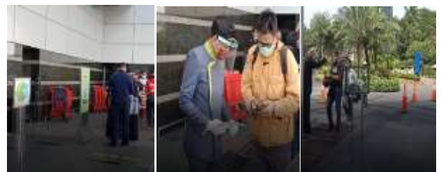
Figure 4. CHSE in the event location