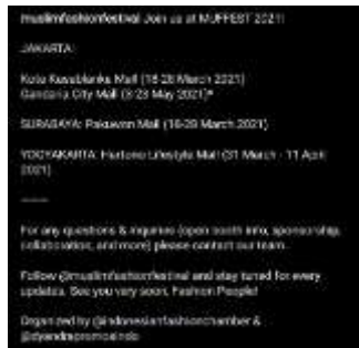
Figure 3. Sales Promotion Narrative through Instagram

promote products and services) is through advertising, personal selling, and sales promotion. This event also works with a number of media partners and sponsors to increase the visibility of MUFFEST events. Companies that join as media partners and sponsors are relevant to the type of event and the company's field, particularly for Muslims and fashion. Wardah, a cosmetics brand, or women's magazines such as Fimela, are two examples.