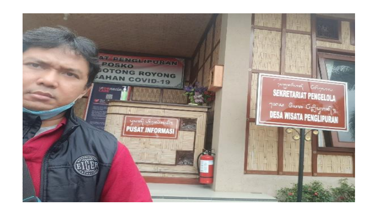
Figure 6 Information Center

The information center is a place consisting of several rooms such as a show room, audio-visual room, lobby room, and so on. The information center serves as a means of important information about the object of a tourist attraction.