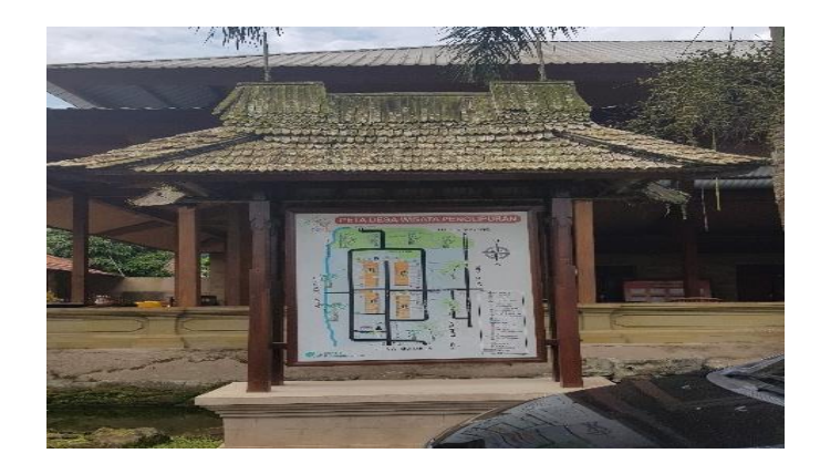
Figure 2, Site Map

The map of the area consists of a map of the village situation, a map of the route of visit and a map showing the location of tourists. The map depicts village tourism areas such as banjar and parahayangan as well as coral blends.