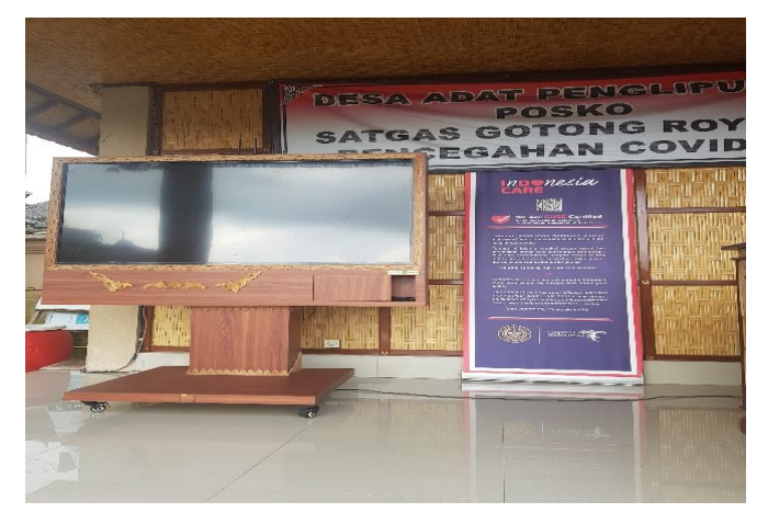
Figure 7 Information Center

In this information center there is also a screen containing videos related to the activities of the visitors to the Penglipuran village.