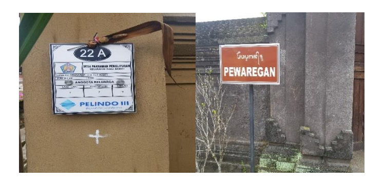
Figure 4 Residence Board/Site Board

The signboard is one of the non-personal interpretations used by visitors to understand what information is in the place.