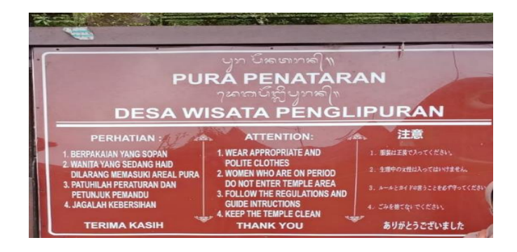
Figure 5 Warning Board

The signboard is a form of non-personal interpretation that contains a warning to visitors to be careful.