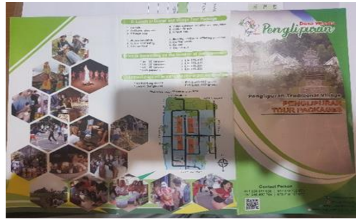
Figure 8 Pamphlet

Pamphlets are paper leaflets with the aim of providing complete information to tourists which usually contains about a topic in Penglipuran Village, the existing pamphlets only contain information on homestay tour packages and tour packages as well as activities carried out while participating in the homestay and the package price per night..