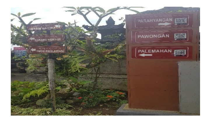
Figure 3 Direction Board