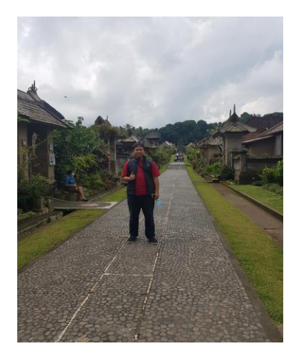
Figure 1. Interpretation Path

The interpretation path is the path used by tourists when visiting a tourist place. At the tourist attraction of