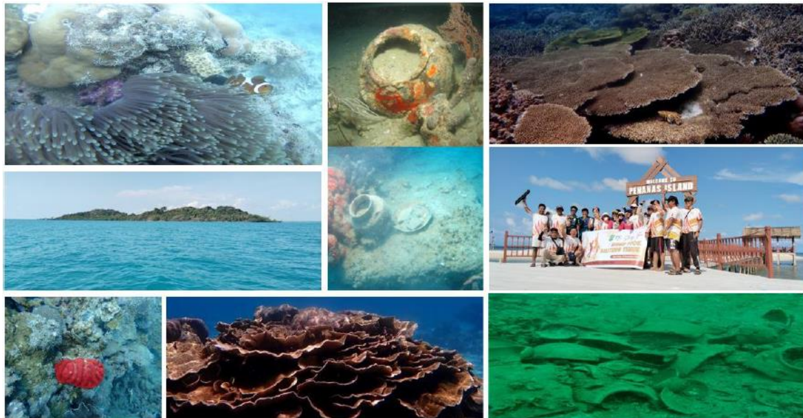
Figure 1: Momparang Archipelago Consists of Various and Diverse Nature Conservation and Tourism Destination (Coral Reefs, Sunken Ship Sites, and Diving Areas).