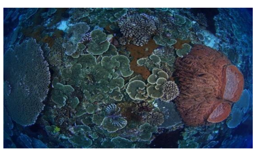
Figure 1 . Marine Park Ternate

Underwater panorama, Nukila Dive center offers access to dive sites with extraordinary marine biodiversity, including various species of fish and coral reefs as well as exclusive spots such as sunken shipwrecks. The beauty of the panorama provides an extraordinary sensation of exploration and discovery for divers of all skill levels. The beauty of the underwater panorama that can be seen in Figure 1 is used as an educational tool to increase tourists' awareness of the importance of marine conservation and ecosystem protection.